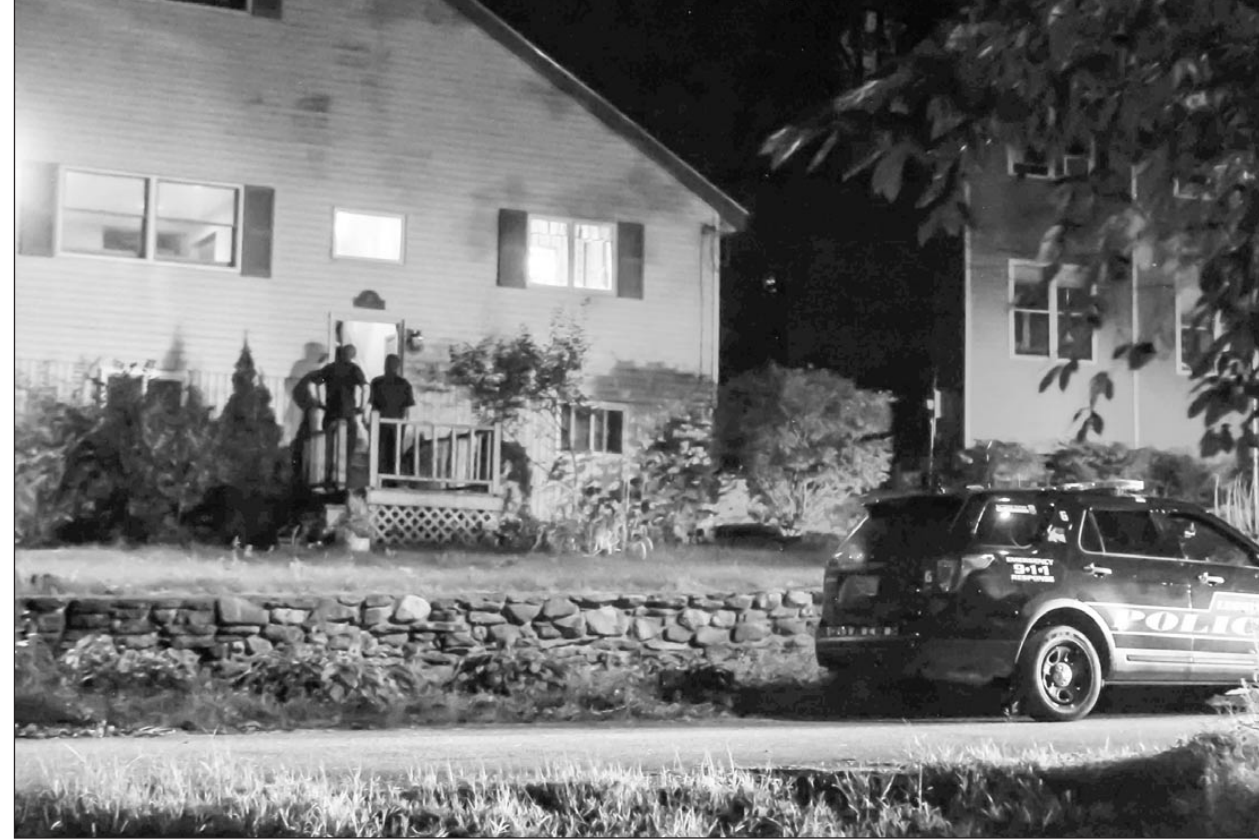
Leominster police work at 20 Lakeview Drive Tuesday night after a man was assaulted.

"All I saw was 10 or 15 police cars out there," the neighbor said. "I think it was domestic, a family fighting."